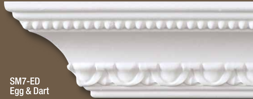
SM7-ED Egg & Dart

All our crown mouldings are available in flexible versions