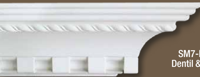
SM7-DL-RP Dentil & Rope