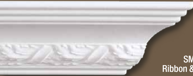
SM7-RL Ribbon & Leaf

Symmetrical Profiles Available in 5 or 7"