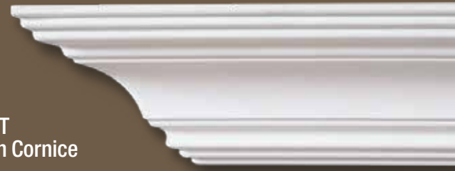
SM7-ST Smooth Cornice