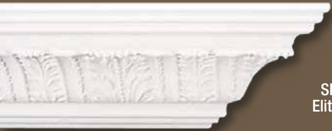
SM7-EL Elite Leaf