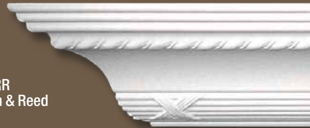
SM7-RR Ribbon & Reed